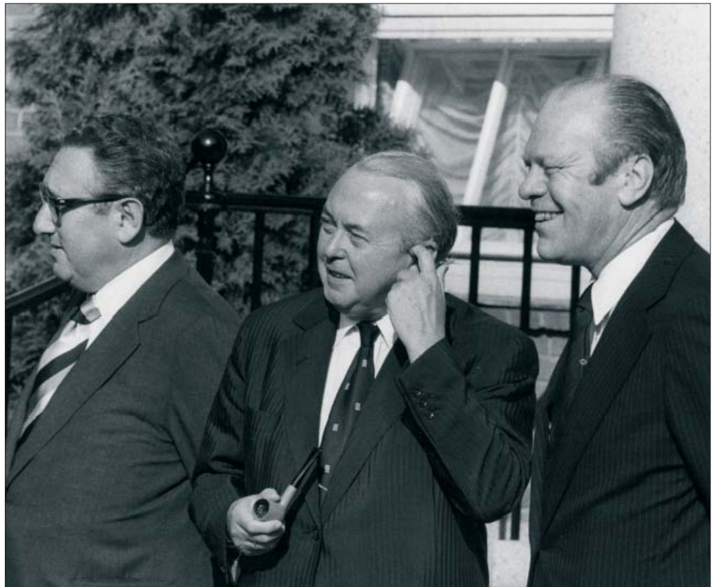
From left to right: US Secretary of State Henry Kissinger; Prime Minister of the United Kingdom Harold Wilson; US President Gerald Ford.