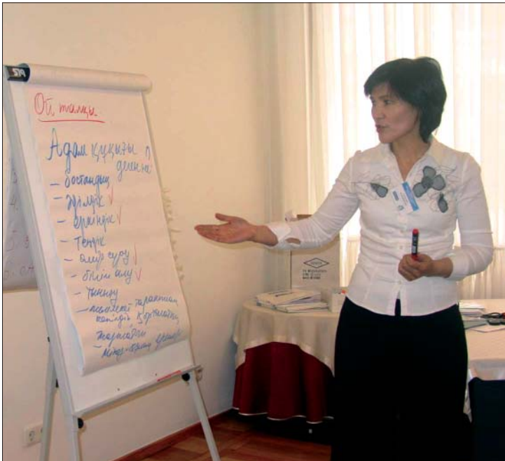
Conducting joint activities with civil society partners: a discussion of environmental issues at an OSCE workshop on the implementation of the Aarhus Convention in Almaty, Kazakhstan, March 2005.

public awareness and education on the environment as well as the public reporting of the environmental impact of policies, projects and programmes” (Charter of Paris 1990). In Turkmenistan, to give an example, the OSCE has conducted a series of seminars promoting environmental education for secondary school students. A number of OSCE field operations and environmental protection groups have joined forces to carry out high-profile lobbying for the adoption and implementation of the Århus Convention on Access to Information, Public Participation in Decision-Making and Access to Justice in Environmental Matters. Evidence of these campaigns’ effectiveness includes public and governmental involvement in several environmental issues highlighted by the Organization, such as the