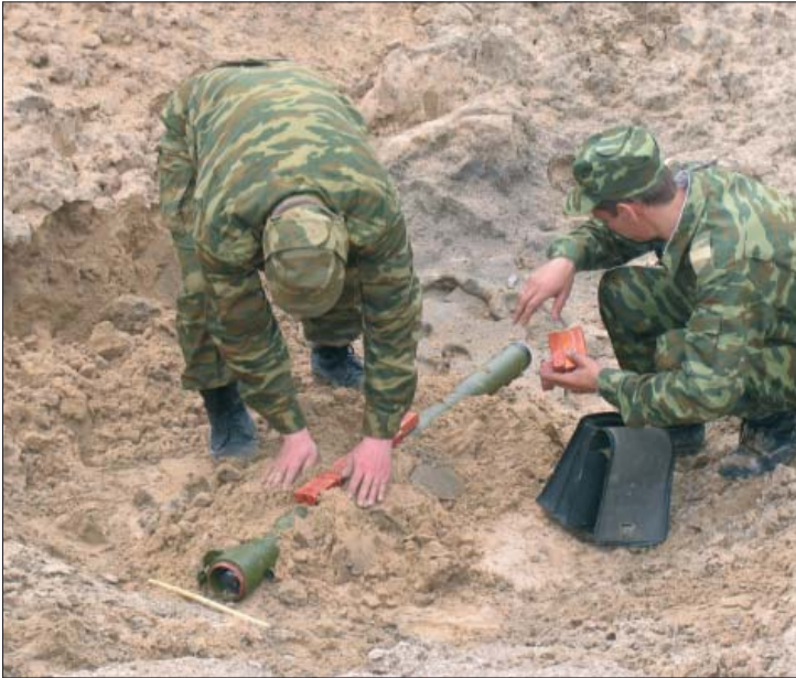
OSCE-supported activities to eliminate surplus small arms and light weapons: Belarusian soldiers prepare to destroy shoulder fired “Strela-IIM” anti-aircraft missiles near Sluck, Belarus, 25 May 2005.

the OSCE set up a Counter-Terrorism Network to strengthen contacts and facilitate the exchange of information.