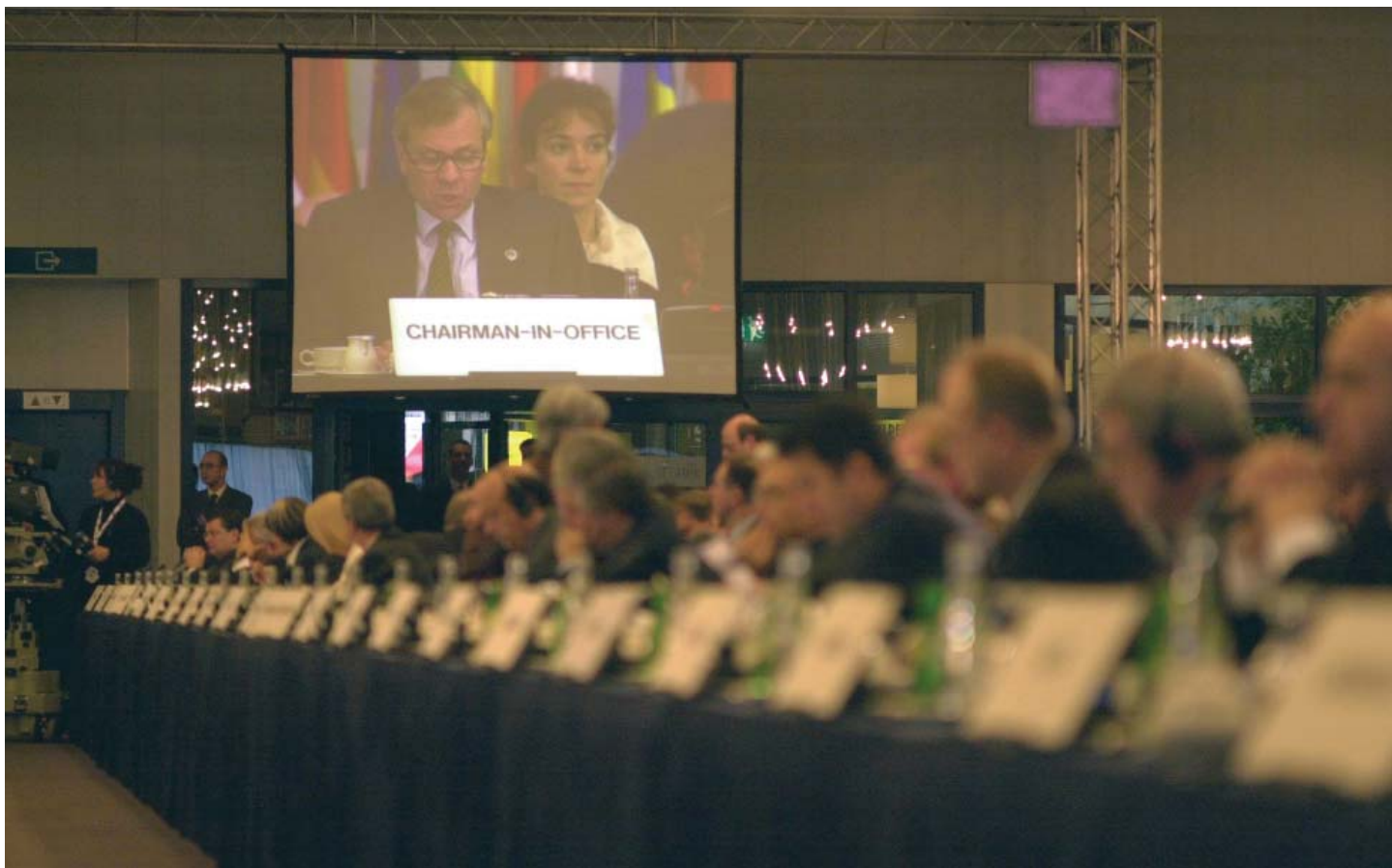
2003 Chairman-in-Office, Netherlands Foreign Minister Jaap de Hoop Scheffer, at the 11 th Ministerial Council, Maastricht, 1-2 December 2003.