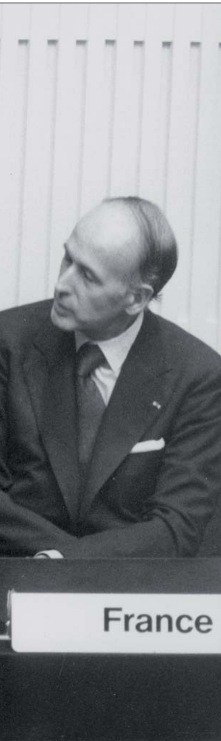
The signing of the CSCE Helsinki Final Act on 1 August 1975 marked the culmination of an intense series of diplomatic negotiations that had begun in the Finnish capital two years earlier. From left to right: The Head of the Government of Spain Carlos Arias Navarro; President of the Republic of Finland Urho Kekkonen; President of France Valéry Giscard d'Estaing.