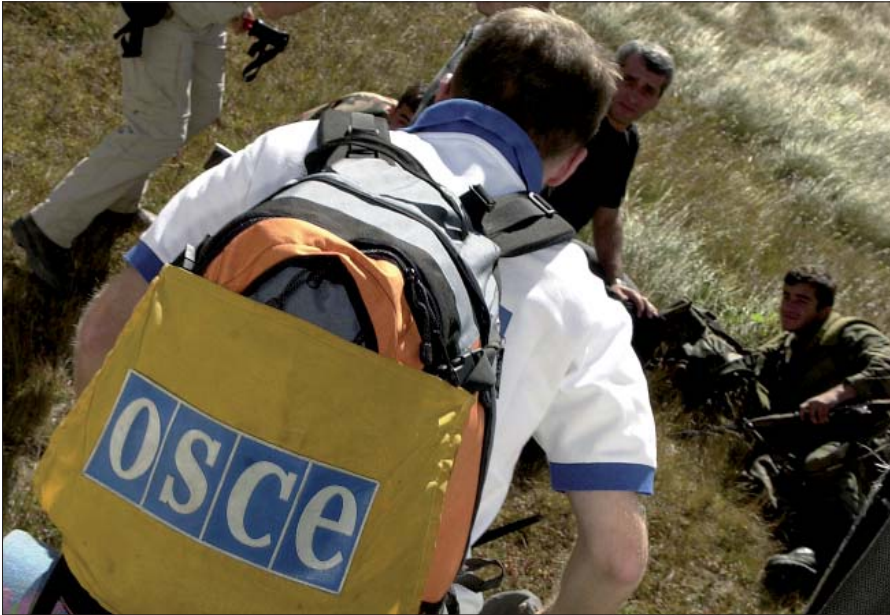
An OSCE border monitor disembarks from a helicopter during an overnight patrol in Shatili, Georgia, October 2002.

political parties and other organizations, to collect information, to make reports, and to establish contact points to co-ordinate the solution of problems identified. The Missions in Kosovo, Sandjak, and Vojvodina had to be closed in June 1993 because the OSCE and the FRY could not agree on an extension. After the unrest that approached civil war level in FYROM in spring and summer 2001, the Spillover Mission to Skopje was converted into a much larger post-conflict rehabilitation mission, whose primary concern is relations between ethno-political groups.