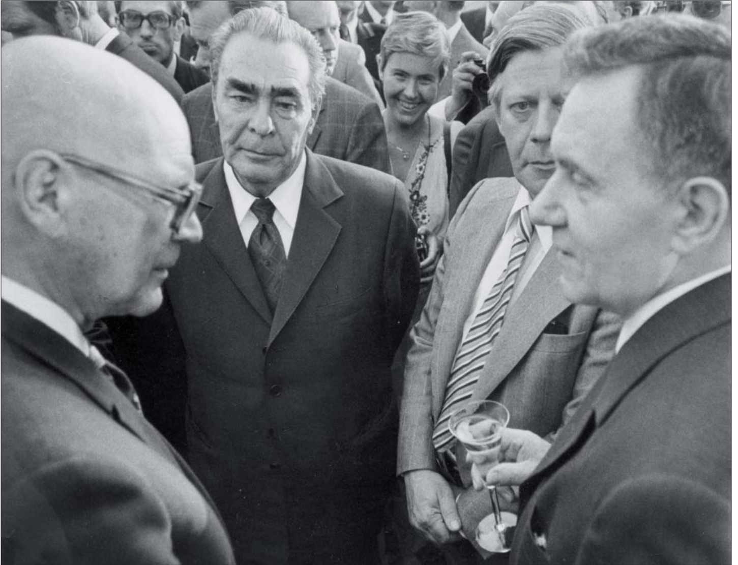
From left to right: President of the Republic of Finland Urho Kekkonen; General-Secretary of the Central Committee of the Communist Party of the Soviet Union Leonid Brezhnev; Chancellor of the Federal Republic of Germany Helmut Schmidt; Soviet Foreign Minister Andrei Gromyko.